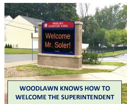
WOODLAWN KNOWS HOW TO WELCOME THE SUPERINTENDENT